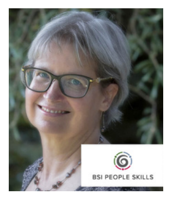
cultures through leadership and team development. Creating Leaders that Work, Teams that Work and Workplaces that Work. Multi-award winning training for businesses and teachers.

Transforming organisations wanting excellent